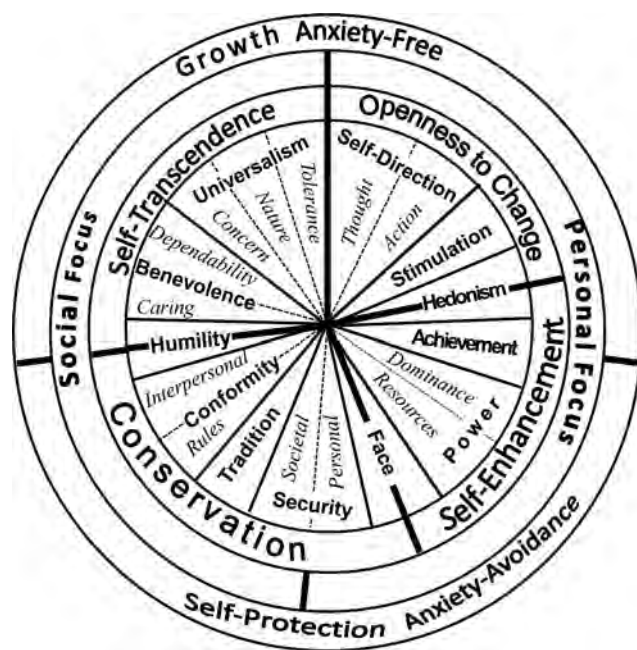
Figure 1. Proposed circular motivational continuum of 19 values with sources that underlie their order.

Evidence from the MDS and CFA analyses discussed above did not suggest a particular order for power–dominance and power–resources; both were near achievement. We tentatively locate dominance nearer to achievement, because both exhibit a focus on interpersonal relations absent in resources. We locate face on the border between power and security. Face is related to power in its