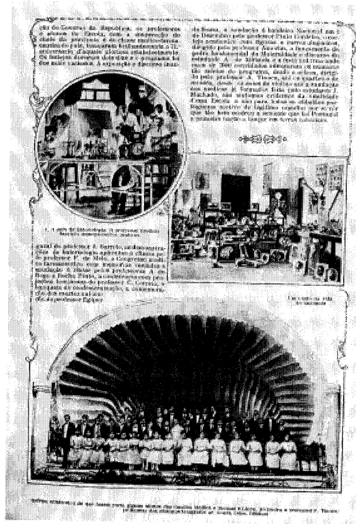
Photograph 6: Page from Ilustração Portuguesa (1914) with a notice on “The Oldest Medical School in Asia”