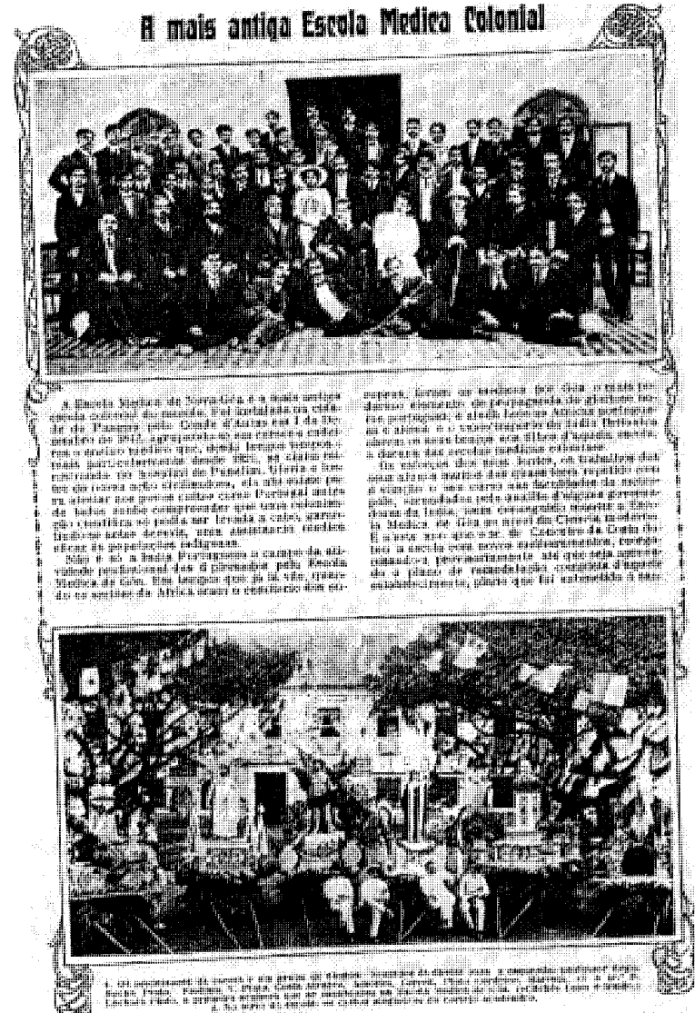
Photograph 5: Page from Ilustração Portuguesa (1914) with a notice on “The Oldest Medical School in Asia”