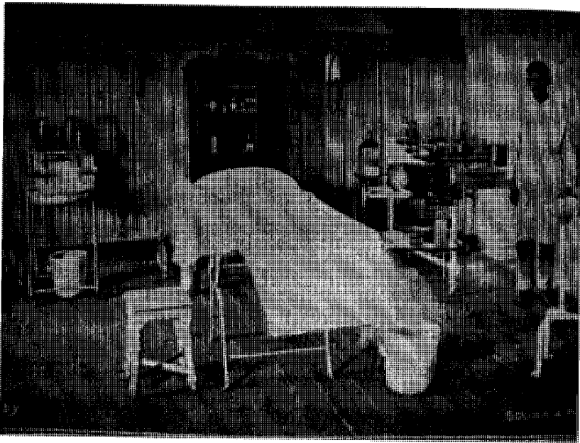
Photograph 4: Medical School of Goa, Central Hospital: Dressing Room (circa 1915).