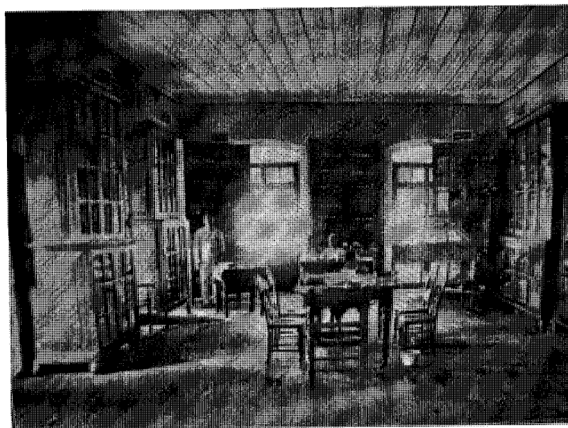
Photograph 3: Medical School of Goa: Library (circa 1915).